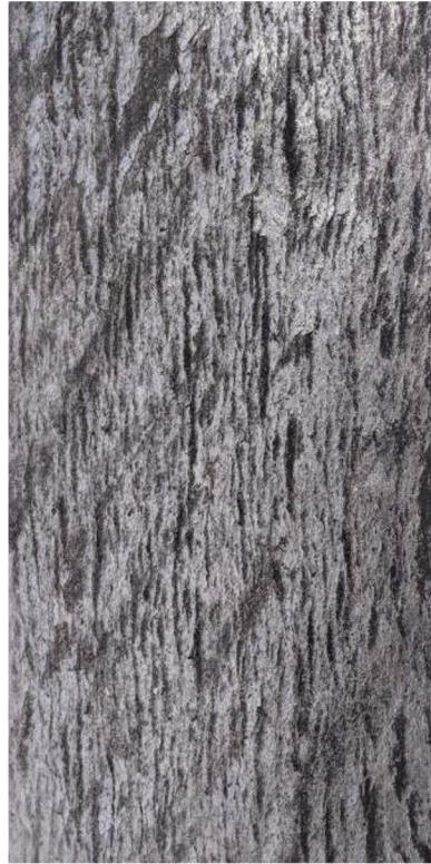
SILVER GALAXY BLACK