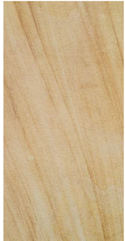
TEAKWOOD SIZE: 4ft x 8ft PRICE: 13,000