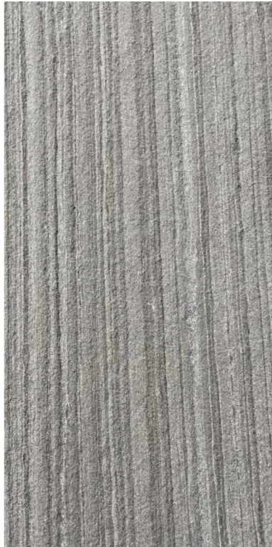
MONSOON SIZE: 4ft x 8ft PRICE: 13,000