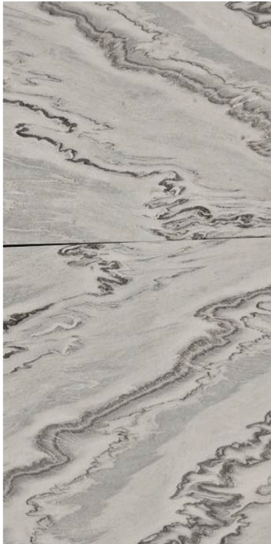
ARTIC WHITE SIZE: 4ft x 8ft PRICE: 13,000