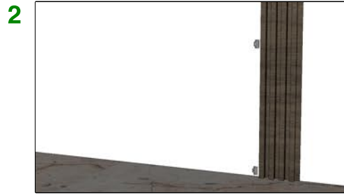
2. AFTER MARKING THE WALL SURFACE AREA. GLUE THE INDOOR PANEL PARALLEL TO THE STARTING LINE, MAKE SURE THE EDGE OF MALE SIDE OF PANEL IS ADJACENT TO STARTING LINE.