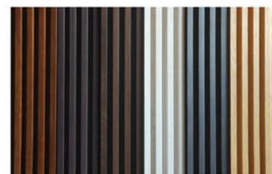
SIZE:155 x 25 x 2900mm MATERIAL : WPC (WOOD PLASTIC COMPOSITE)