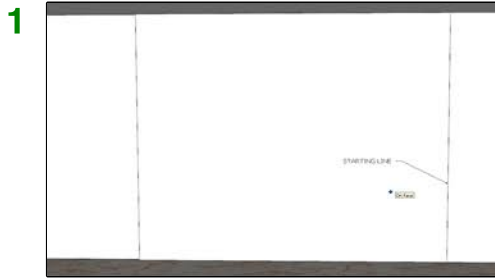
1. FOR INSTALLATION OF INDOOR FLUTED PANEL, FIRST MARK THE STARTING LINE OF WALL SURFACE.