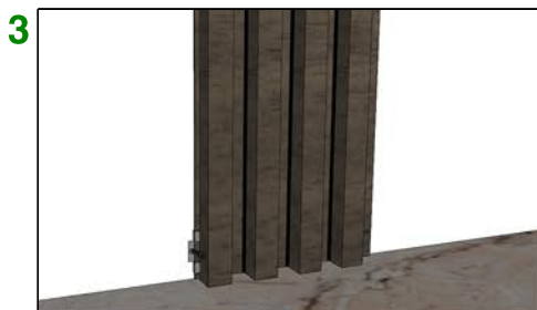
3. TO SECURE THE PANEL AFTER GLUED TO THE WALL. INSTALL THE CLIPS ON THE FEMALE SIDE OF THE PANEL IN EVERY 500MM.